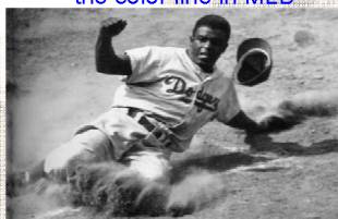
Jackie Robinson breaks the color line in MLB